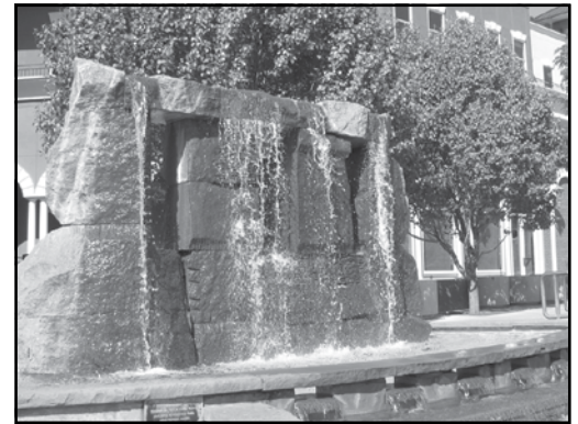
Summertime brings the tinkle of water from the many fountains in the Downtown area. Pictured here are: The Headwaters Fountain, 1st and Union; Sister Cities Fountain, Sister Cities Plaza and the Farley Fountain on the Riverwalk between Main and Union. We encourage you to look around downtown and find these and others.