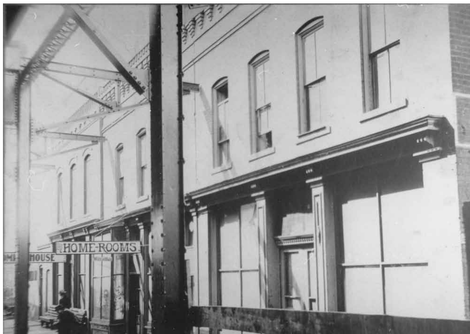
This photo shows a building which I believe may be the building where the old Greenlight was located on First Street. The photo is in the WPA photos collection at the Pueblo County Historical Society.

Information for this story came mostly from the Western History Section at the Rawlings Library. The photo came from the collection at the Pueblo County Historical Society.